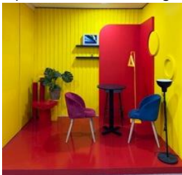
Option 1: Yellow background